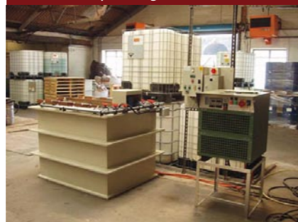
IONMET coating facility and workshop for ionic liquid solvents