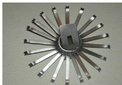
Ti and Ti/Al alloy, Ta6V, chemical depassivation (acid); electropolishing in Ethaline bath

Ionic liquids are, in principle, ionic solvents which melt at less than 100 degrees Celsius – often at room temperature or below. High temperature melts are commonly referred to as ‘molten salts’ or ‘fused salts’, with salts in the liquid phase at low temperature described as ‘room-temperature ionic liquids’ or ‘liquid organic salts’. The composition and properties of ionic liquids are determined by the combination of cations (positively charged ions – formed when an atom loses electrons) and anions (negatively charged ions – formed when an atom gains electrons), and their resulting differences in structure and intermolecular interactions. This delicate interplay allows scientists to then mix-and-match a number of small anions and a great diversity of large cations to produce ‘designer solvents’, customisable to suit a myriad of particular needs such as dissolving chemicals in a reaction or metal finishing under stable chemical conditions